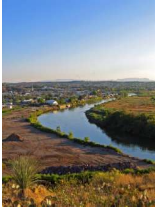
The Rio Grande looking east