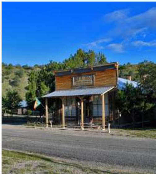
Historic Monte Cristo Saloon & Dance Hall is now a Gift Store & Gallery