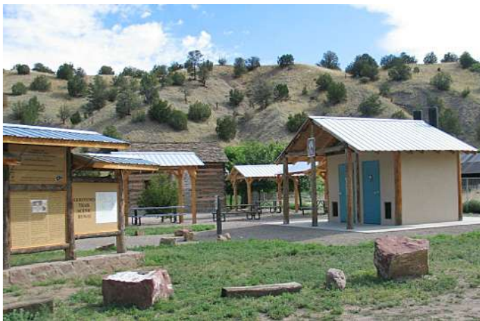
Rest Area in Chloride

The GTNSB continues on Hwy 52 to the historic mining town of Winston. The road comes to a "T" and at this point the Byway goes either left to the second historic mining town of Chloride, or right to continue on to the junction of Highways 52 and 59. The Byway continues on Hwy 59 across vast mountain meadows, shifting into beautiful forest terrain, crossing the Continental Divide National Scenic Trail (CDNST) and ending in Beaverhead. Hwy 52 and 59 have added three rest areas that include informational signs and restrooms.