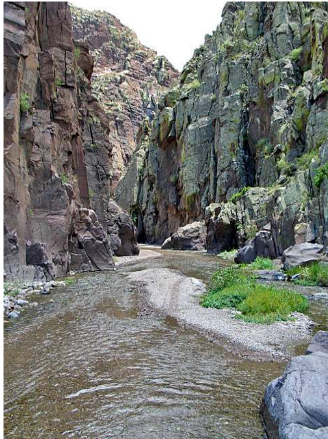
Monticello Box Canyon

Museum displays fossils and geology of area as well as history of the area covered by the lake.