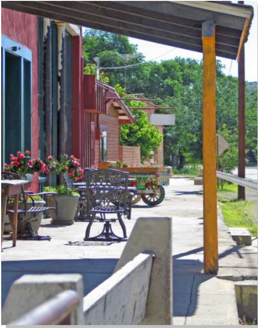
Sitting places along sidewalk, downtown Hillsboro