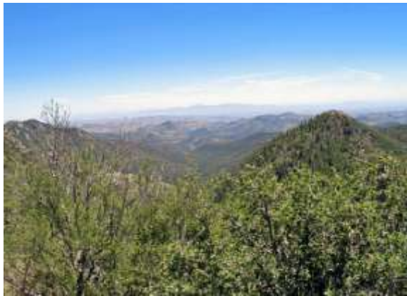
View from Emory Pass looking east

From here the climb becomes much steeper, gaining nearly 3000 feet in altitude in the next nine miles, where it crests at Emory Pass and starts down the other side. The terrain changes from towering pines on the mountains and cliffs overshadowing the road to gentle slopes, with juniper, cedar and scrub oak, until it reaches the Mimbres River Valley at San Lorenzo where the Geronimo Trail National Scenic Byway ends and the Trail of the Mountain Spirits National Scenic Byway begins.