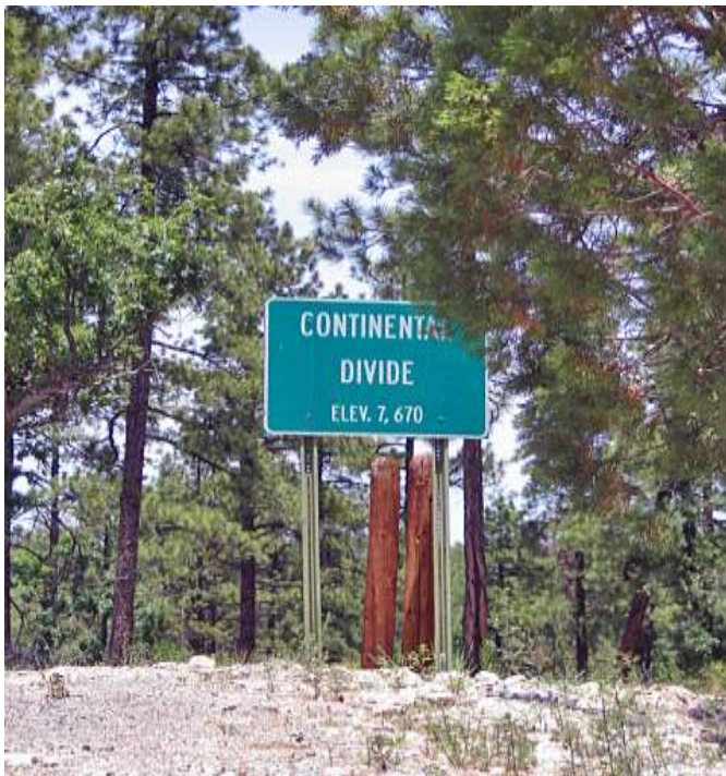
Sign at Continental Divide National Scenic Trail off Hwy 59

Beaverhead Work Center is located immediately to the west of the end of pavement of NM 59. This Work Center is a part of the Black Range Ranger District of the Gila National Forest. Both fire and trail crew personnel are stationed here. Location of an outside public telephone and information station. When staff is available in the office, Forest Service maps and other information can be obtained. Potable water is also available. There is no camping allowed in the administrative site, but this is an important information point and a place to re-supply water.