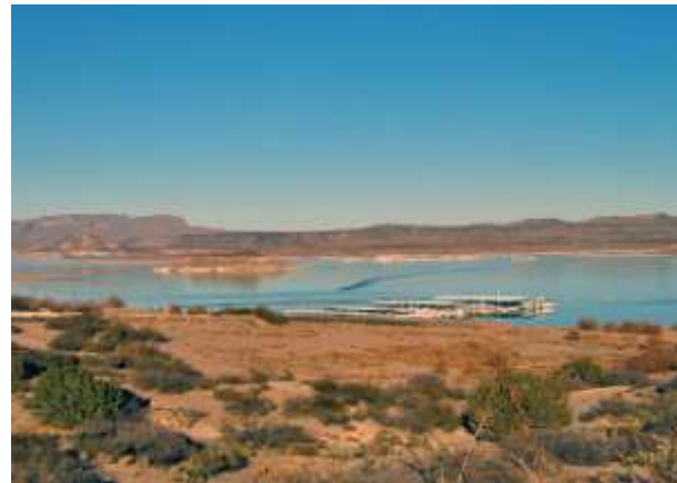
Marina del Sur, Elephant Butte Lake

The mountains of the Geronimo Trail area abound with hiking trails, mountain campgrounds and small lakes. (Numbers 1 – 14 correspond to map on page 39).